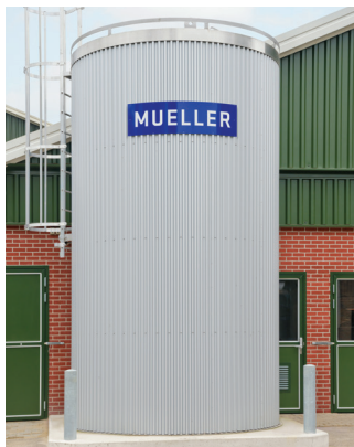
Grey Color Code: RAL9006

Weather proof aluminium cladding available in three standard colours*: