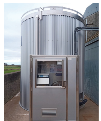
Silo Alcove view

*Colors in this brochure may vary from actual colors.