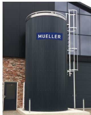
Antracite Color Code: RAL7016