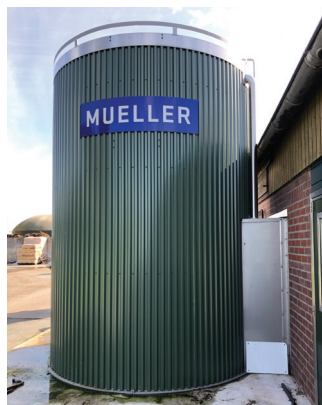
Dark Green Color Code: RAL6020